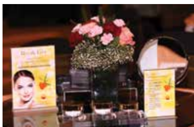
The Royale D'or skin care product range consists of the Regenetics Lifting & Firming Day Cream, Regenetics Advance Recovery Night Cream and Regenetics Wrinkle-Repair Eye Contour.