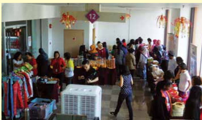
Employees visiting various booths at the Chinese New Year Bazaar 2019.