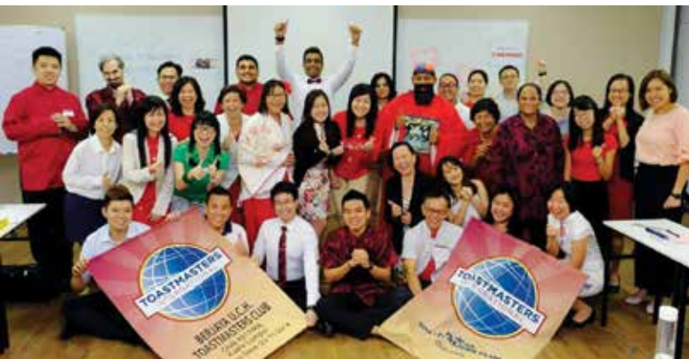
Berjaya UCH Toastmasters Club & MAICSA Toastmasters Club.