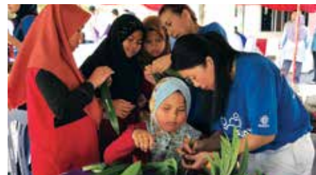
Adults and children learning how to make natural air fresheners using ‘pandan’ leaves.