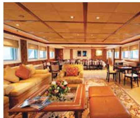
Interior of the 'Langkawi Lady'.

There are a few charter packages available for weddings, private events and gatherings. The duration for a sunset cruise is 4 hours, full day cruise is 8 hours and overnight charter is 24 hours. Upon reservation, guests can pre-arrange their food and beverage from Berjaya Langkawi Resort. Throughout the cruise, a private chef and butler will be onboard to cater to their requests. For couples who would like to host their wedding ceremonies on the 'Langkawi Lady', ceremonial requirements such as flower arrangements, decorations, wedding cake, champagne toasting, lunch and F&B service can be arranged as well.