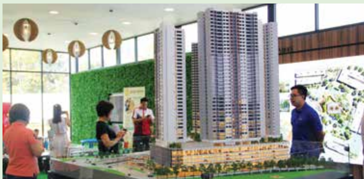
The scale model of The Tropika.

The Tropika has easy access to major highways and is well-served by public transportation systems, including the Rapid KL bus and Light Rail Transit train services. It is also within close proximity to various educational institutions, as well as sporting and recreational facilities.