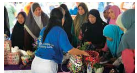
A volunteer showcasing handcraft items made from recyclables materials to the villagers.