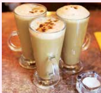
Classic Malaysian Teh Tarik.