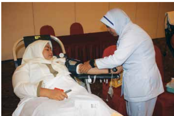
Berjaya Langkawi Resort's staff donating blood.

On 4 March 2019, Berjaya Langkawi Resort organised a blood donation drive at the resort's ballroom. A total of 24 pints were collected from 35 hotel associates who participated in the blood donation drive.