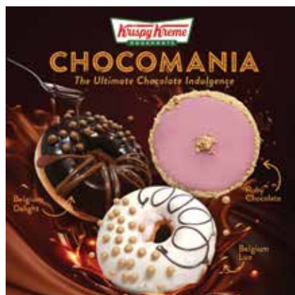
The Chocomania Doughnut series.