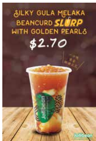
The Silky Gula Melaka Beancurd Slurp with Golden Pearls.

Jollibean launched two new drinks across all its stores on 1 February 2019. The Silky Gula Melaka Beancurd Slurp with Golden Pearls puts a twist to the trendy bubble tea culture by using Jollibean's signature soymilk as its base and luscious golden pearls for that 'pop' of colour. The Gula Melaka Beancurd Slurp reflects Singapore's local food culture. Jollibean also introduced the Soy Panna Cotta, a signature Italian dessert reimaged with soy.