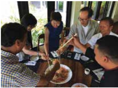
Staff tossing Yee Sang for good luck and prosperity throughout the year.

On 19 February 2019, staff at The Taaras Beach & Spa Resort celebrated Chap Goh Mei with a Yee Sang tossing session at Asean All Day Dining, to strengthen the bond between the staff besides inviting good luck and prosperity throughout the year.