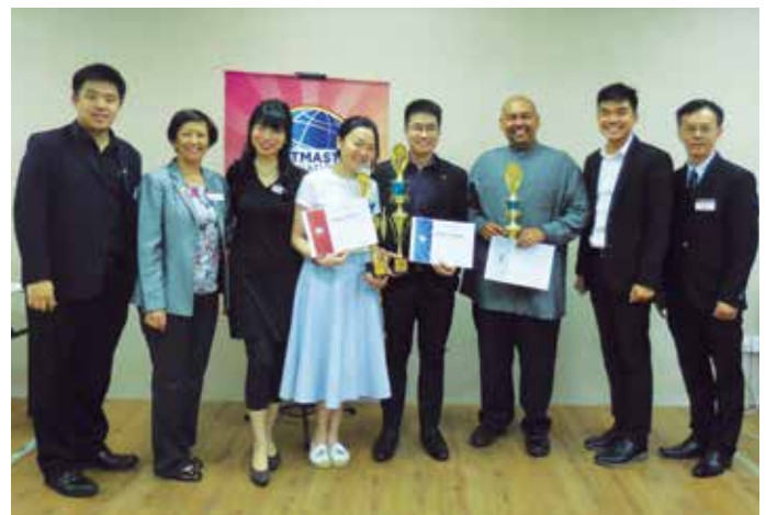
Winners of BERJAYA UCH Toastmasters Club International Speech Contest.