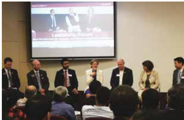
District leaders from various regions addressing the delegates.