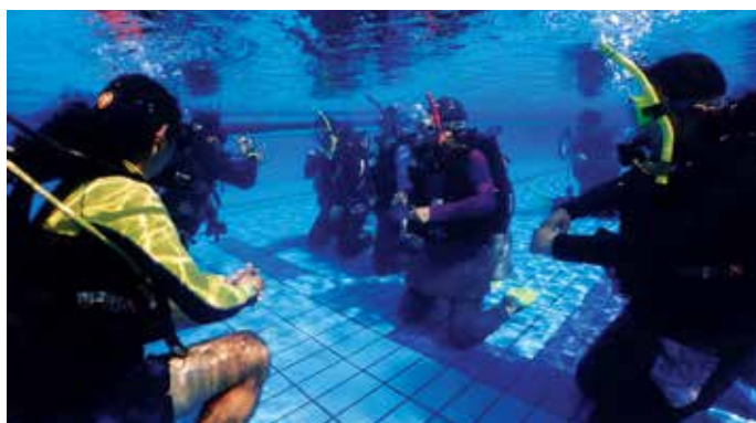
Participants undergoing the session through hand signals.