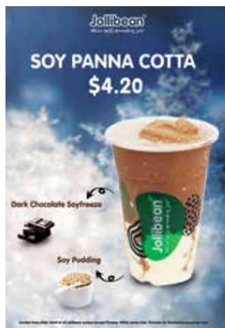
The Soy Panna Cotta.