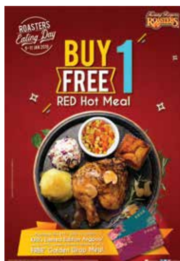
The Roasters Eating Day promotes healthy eating and an active lifestyle.

Kenny Rogers ROASTERS' ("KRR") decade-long healthy initiative – Roasters Eating Day ("RED") was at all KRR restaurants nationwide from 9 to 11 January 2019! The campaign was an initiative to encourage the public to start the year with wholesome food and adopting an active lifestyle.