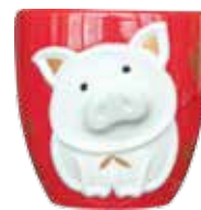
The Year of the Pig mug.