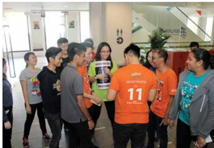
Students competing in various games to obtain the highest amount of points for their groups.