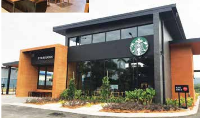
The Starbucks Seremban 2 Drive-Thru outlet.