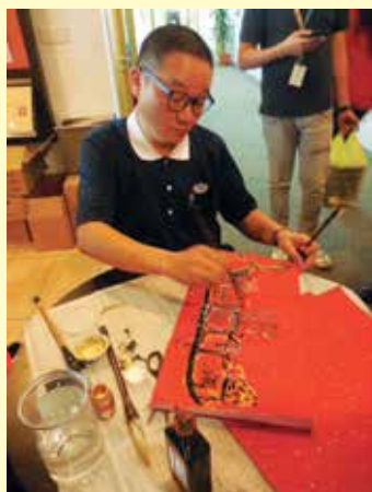
Tzu Chi Foundation volunteers drawing Chinese New Year couplets.

The Employee Engagement Committee (“EEC”) organised a Chinese New Year Bazaar on 18 January 2019, the first for the year 2019 and the 6th event since the Committee’s establishment on 27 April 2018.