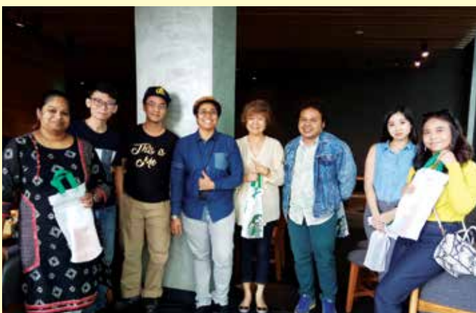
The media and bloggers with the gifts from Starbucks Malaysia.

In conjunction with the Starbucks Winter launch campaign, Starbucks Malaysia hosted a Teavana High Tea event which saw the gathering of more than 40 media and bloggers. The event highlighted the new beverages, food and merchandises. The media and bloggers in attendance were also served the new food offerings, including festive treats like the orange eclairs for the Lunar New Year and the heart shaped doughnuts for Valentine's Day. They were also treated to samples of the new beverages such as Chestnut Black Tea Latte, Mango Passion Cold Foam, Iced Shaken Black Tea and Matcha Cold Foam Iced Americano.