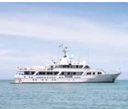
The 'Langkawi Lady'.

From February 2019, the 'Langkawi Lady', a Berjaya-owned luxury yacht, is all ready to set sail in the Langkawi Island. With the 'Langkawi Lady', guests staying in Berjaya Langkawi Resort can opt for a vacation that offers privacy and experience the ultimate exclusivity and comfort being on a chartered yacht.