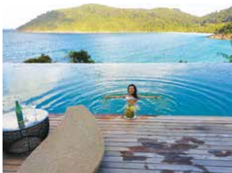
A guest taking a dip in the infinity pool at The Taaras Villa.

Guests can also experience fun Zumba sessions every weekend. Choreographed by the resort's very own talented staff, the sessions are available on Fridays at 6pm and Saturdays at 8pm at the Bayu Bar.