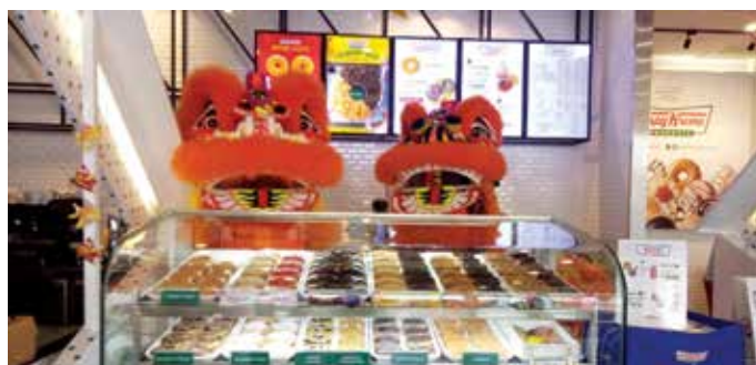
The lion dance at the Genting Premium Outlet.

Krispy Kreme ushered in Chinese New Year with a pair of Chinese-inspired doughnuts. The first being the Sesame Seed Doughnut which has a delicious red bean filling coated with sesame seeds on top. The second new doughnut, Golden Coin Doughnut, which has a pandan green bean filling symbolises in bringing luck to the customers during the festive season. In conjunction with the joyous festive season, a lion dance was also held at Krispy Kreme Genting Premium Outlet.