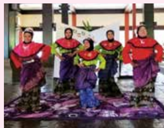
Season Opening Welcoming Ceremony at Redang Island Resort.

On 1 February 2019, the season opening at The Taaras Beach & Spa Resort was marked with a cocktail session hosted by the resort for all guests. After 3 months of closure due to the year-end monsoon season, staff were geared up to provide guests with a memorable experience at the resort. Guests were treated to canapes, alcoholic and non-alcoholic beverages, with Jojo, the resort's mascot on hand to entertain them.