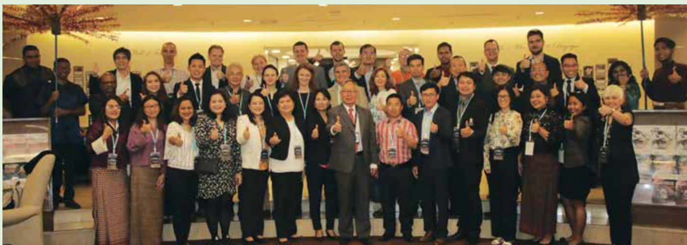
Participants of the Erasmus+ Programme (Key Action 2) Capacity Building for Higher Education project.

The conference, held at BERJAYA UC from 5 - 8 March was the first meeting among a series of meetings that will be held over the next three years at various partner institutions. The meeting discussed the introduction of the FRIENDS project, and how it would develop while also exploring the development of project task force action plans. The FRIENDS delegates were also treated to a Malaysian-themed welcome dinner, a tour of the city, and performances of Malaysian ethnic dances.