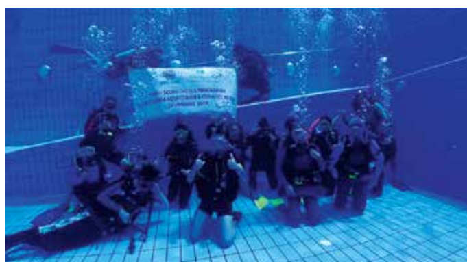
The participants completed their first session of the programme.