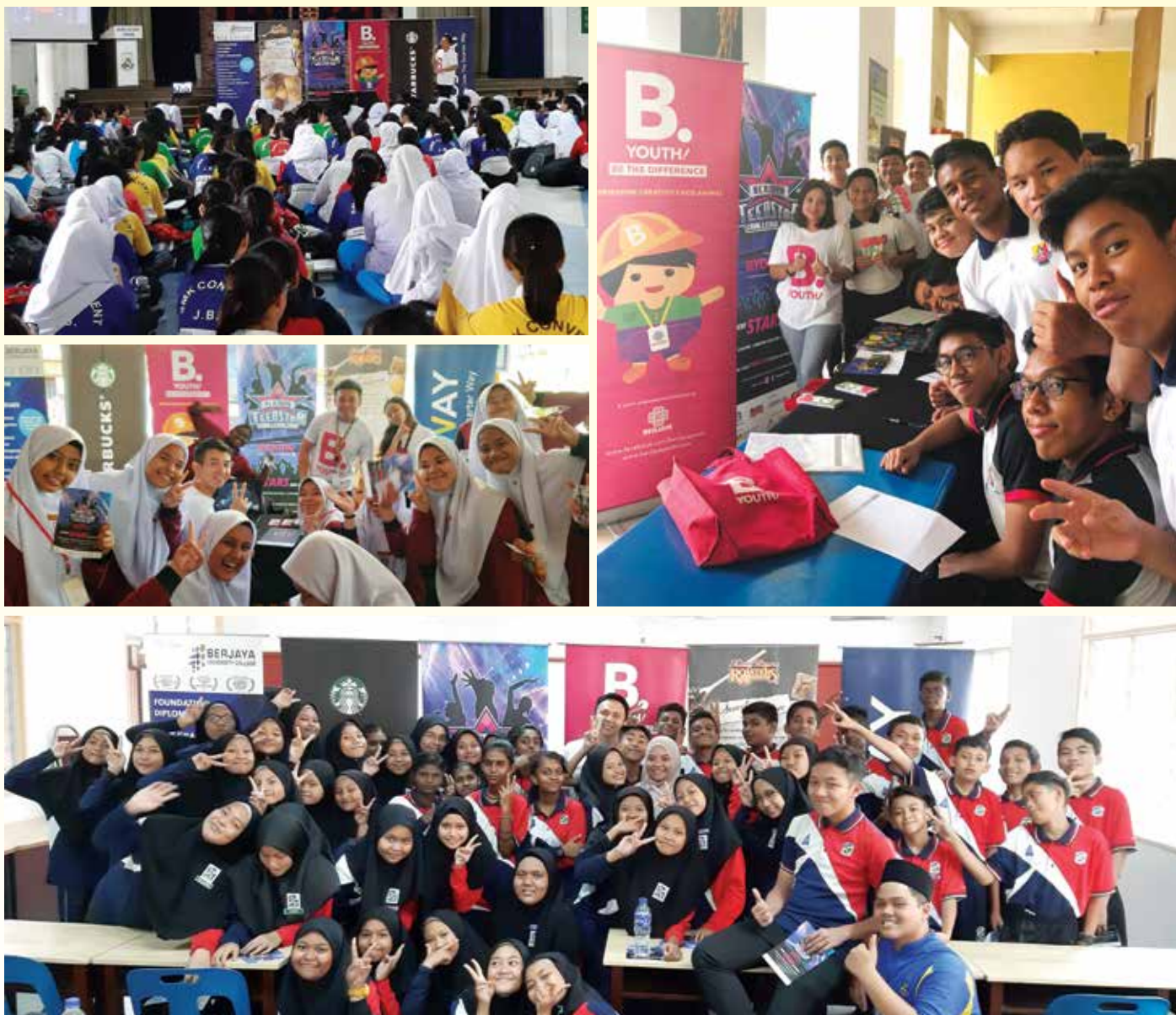
Roadshows conducted at SMK Infant Jesus Convent, Johor Bahru (top left), Sekolah Sultan Alam Shah, Putrajaya (top right), SMK Aminuddin Baki, Kuala Lumpur (bottom) and SMK Tengku Ampuan Rahimah, Klang (centre left).

For more information, please visit www.berjayayouth.com/creativity.php or follow Berjaya Youth's Facebook and Instagram pages for the latest updates.