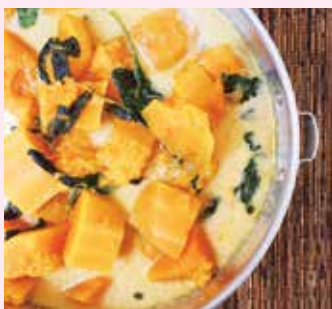
One of their signature dishes, Pumpkin Masak Lemak.