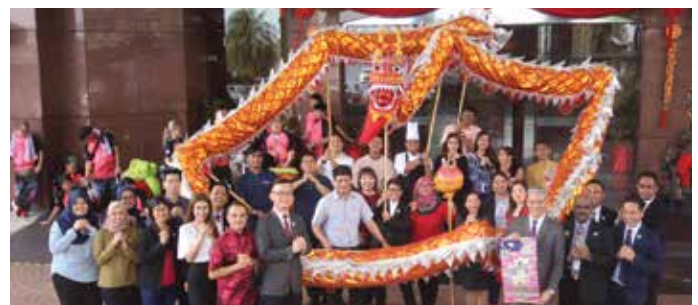
Staff of Berjaya Waterfront Hotel and Berjaya Waterfront Complex.