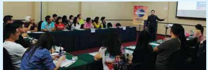
Participants listening attentively to the presenter at the Talk cum Demo Meeting.

The Club conducted the Toastmasters Awareness Talk cum Demo Meeting for 20 participants at the Bukit Jalil Golf & Country Resort on 13 January 2019. The participants gained better understanding about Toastmasters and the learning approach for members to become confident speakers and leaders.