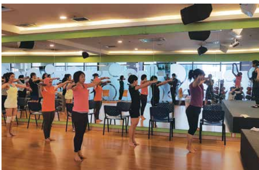
Employees at the Booty Barre Fitness session.