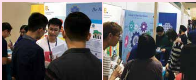
The Berjaya Recruitment Team attending to visitors at their booth.

Berjaya Corporation Berhad, Berjaya Books Sdn Bhd and Berjaya Starbucks Coffee Company Sdn Bhd participated in the Jobstreet.com Malaysia Career & Training Fair 2019 at Mid Valley Exhibition Centre on 2 and 3 March 2019. A total of 111 companies from various industries provided career opportunities to job seekers.