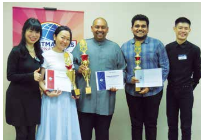
Winners of BERJAYA UCH Toastmasters Club Table Topics Contest.