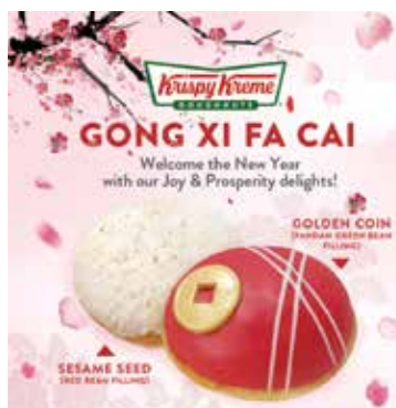
The Sesame Seed Doughnut and Golden Coin Doughnut.

Krispy Kreme ushered in Chinese New Year with a pair of Chinese-inspired doughnuts. The first being the Sesame Seed Doughnut which has a delicious red bean filling coated with sesame seeds on top. The second new doughnut, Golden Coin Doughnut, which has a pandan green bean filling symbolises in bringing luck to the customers during the festive season. In conjunction with the joyous festive season, a lion dance was also held at Krispy Kreme Genting Premium Outlet.