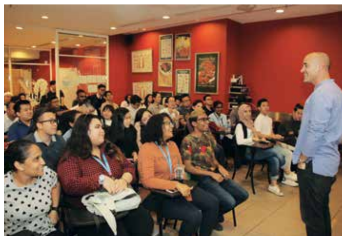
Celebrity Chef David Rocco addressing his audience.

That evening, guests were given the opportunity to sample Chef Rocco's dishes at an exclusive sit-down dinner, consisting of a decadent five-course meal. The menu featured traditional Italian dishes with Chef Rocco's personal twist. The meal was prepared meticulously by students from the Faculty of Culinary Arts, and served diligently by students from the School of Hospitality. Guests took the opportunity to chat and take selfies with the visiting chef.