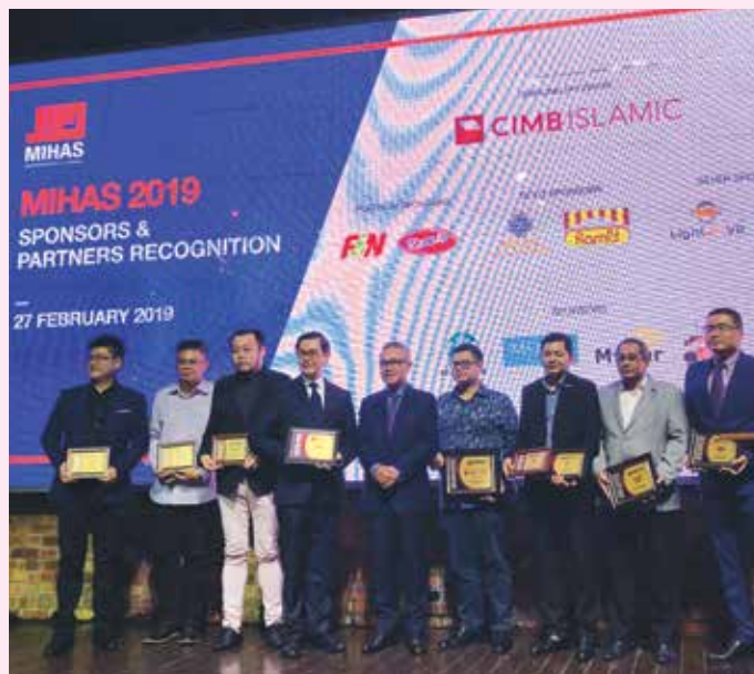
Berjaya Starbucks Coffee Company Sdn Bhd recognised for its support for trade inclusion.

For its efforts in providing a platform for MIHAS to thrive as a trade exhibition, Starbucks Malaysia was honoured with a plaque of recognition during the launch, which is fully supported by the Malaysia External Trade Development Corporation (MATRADE), a national trade promotion agency under the Ministry of International Trade and Industry.