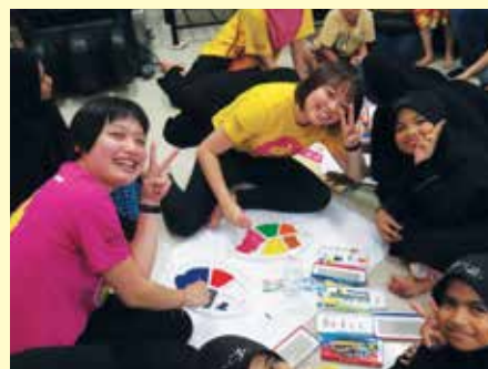
ANSA KL & BHR associates entertaining the residents.