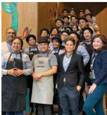
The staff members of Starbucks Reserve Berjaya Times Square.

The opening created much excitement with customers queuing at the entrance in anticipation of the launch of the store. The media were treated to a tour of the venue, as well as a coffee-tasting session with the coffee masters where they shared their knowledge of the current Reserve coffee line-up.