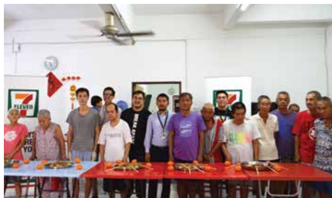
7-Eleven Malaysia team with the residents of En Yuan Old Folks Home.