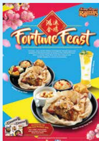
The Fortune Feast featuring The Golden Wrap Meal.