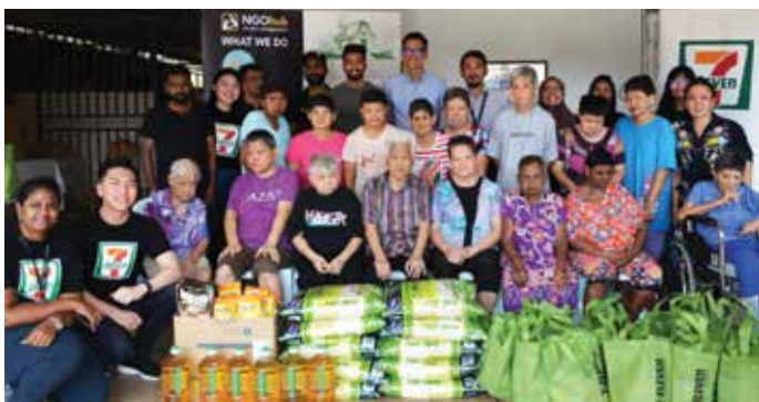
7-Eleven Malaysia team with the ladies of Grace Home Klang.