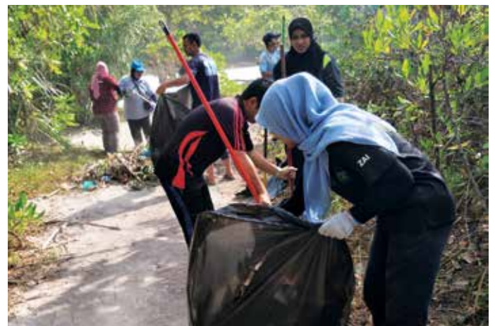
Committee members working together at the clean-up.

On 7 March 2019, the Associate Welfare & Recreation Committee of The Taaras Beach & Spa Resort organised a clean-up activity at Teluk Dalam Besar, Redang Island. This was a way for the staff to give back to Mother Nature by doing their part for a cleaner Redang Island.