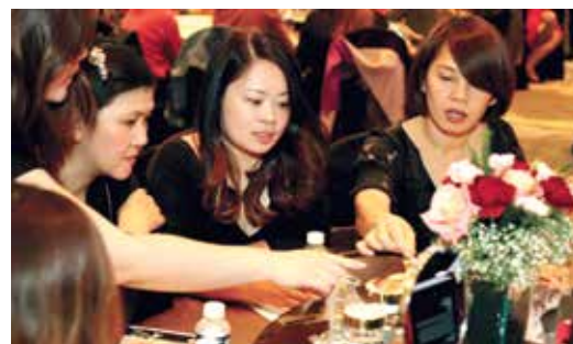
Guests trying their hands on the Royale D'or skin care and Dignità Cosmetics.