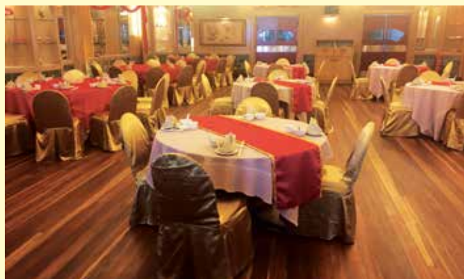
Interior of Xuan Restaurant.

The operating hours of the restaurant is from 6.00pm to 10.30pm (subject to seasonal operating hours and closures).