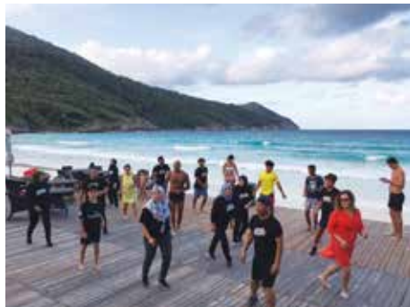
Staff and guests having a good time at the Zumba session.