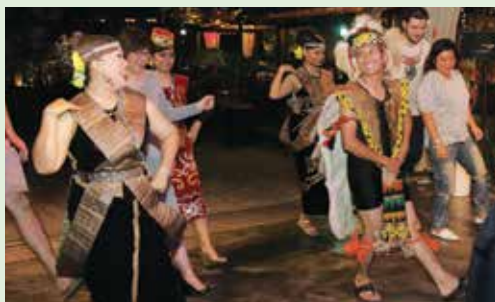
Participants learning the steps of a Malaysian ethnic dance.

BERJAYA University College ("BERJAYA UC") is proud to be a partner of the Erasmus+ Programme (Key Action 2) Capacity Building for Higher Education ("CBHE") project entitled, 'Furthering International Relations Capacities and Inter-cultural Engagement to Nurture Campus Diversity and to Support Internationalisation at Home ("FRIENDS")'. This will be a three-year project involving three stages: planning, development and implementation funded by the European Union, promoting modernisation, accessibility and internationalisation of higher education in partner countries across the world, including Asia.