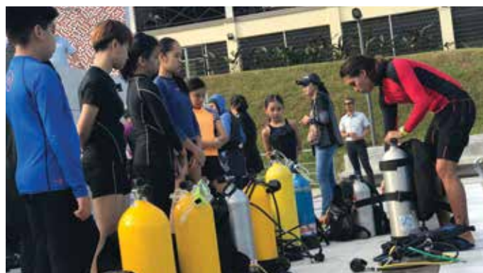
Participants listening attentively to the briefing on the safety check of the equipment.