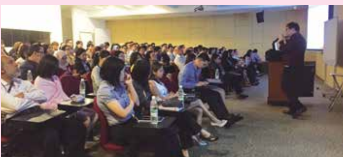
The audience were educated about ETFs and REITs as alternative investments that enable investors to spread their cash and have a diversified portfolio with different listed asset classes.

Approximately 130 staff attended a Market Awareness Talk on Exchange Traded Funds (“ETFs”) and Real Estate Investment Trusts (“REITs”) at Berjaya University College, Kuala Lumpur on 27 March 2019. The talk was organised by Berjaya Cares Foundation in collaboration with Bursa Malaysia Berhad.