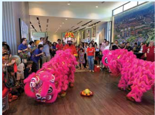
Visitors at the launch were treated with a lion dance performance.