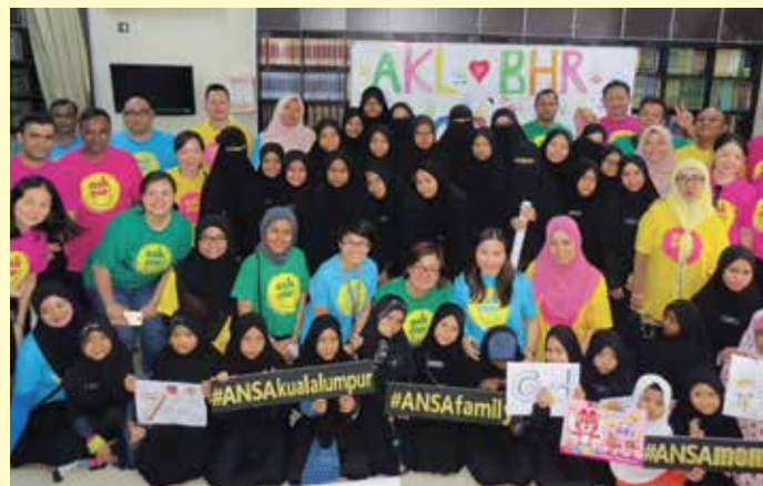
ANSA KL & BHR associates with the residents from Rumah Kebajikan Baitul Ehsan Al-Khairi Orphanage.

After a quick introduction of the orphanage home, the hotel associates began work to spruce up the home. The hotel associates also brought groceries for the home.