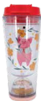
The limited edition Year of the Pig tumblers.

Inspired by the zodiac of the year, Starbucks Malaysia welcomed the Lunar New Year with an exclusive collection of piglet-themed merchandise. Ranging from a selection of Thermos bottles to coffee mugs, the Year of the Pig collection featured pink piglets frolicking amongst stylish stripes and prosperous yellow flowers. This exclusive collection also included a limited edition set of 12 mugs featuring the animals in the Chinese zodiac.